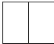
2 - 5x7